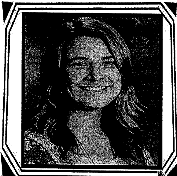
a PICTURE OF ME