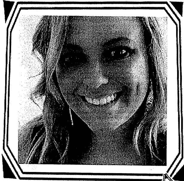
a PICTURE OF me